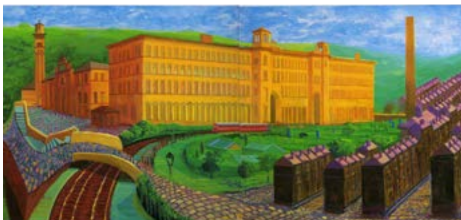
Park before heading home.